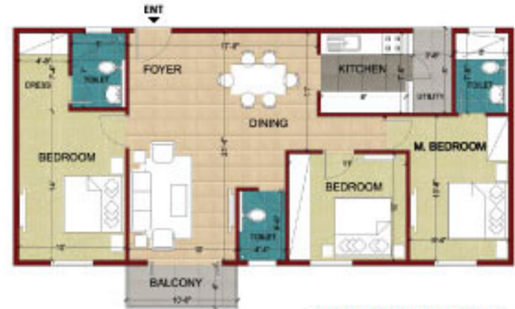
3 Bed Room Unit-Type - 1 Super Builtup Area - 1275 sqft