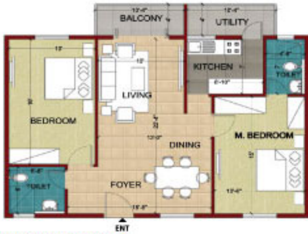
2 Bed Room Unit-Type - 5 Super Builtup Area - 1060 sqft