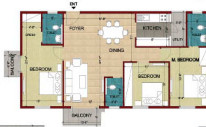
3 Bed Room Unit-Type - 1 A Super Builtup Area - 1310 sqft