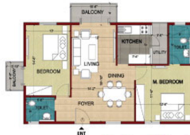
2 Bed Room Unit-Type - 1 A Super Builtup Area - 1015 sqft