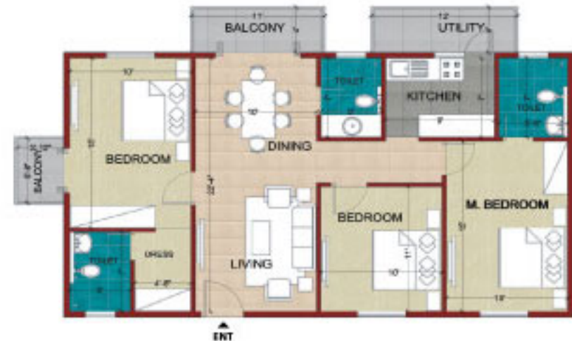
3 Bed Room Unit-Type - 2 A Super Builtup Area - 1290 sqft