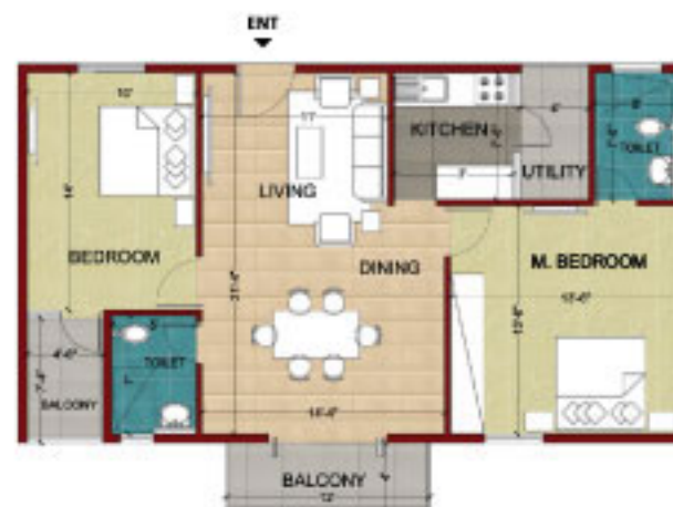
2 Bed Room Unit-Type - 4 Super Builtup Area - 1085 sqft