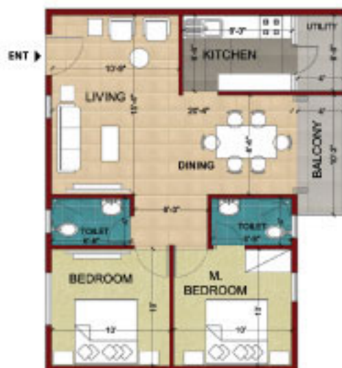
2 Bed Room Unit-Type - 3 Super Builtup Area - 860 sqft