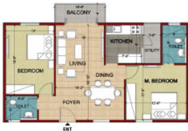
2 Bed Room Unit-Type - 1 Super Builtup Area - 980 sqft