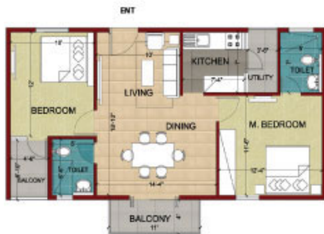
2 Bed Room Unit-Type - 2 Super Builtup Area - 940 sqft