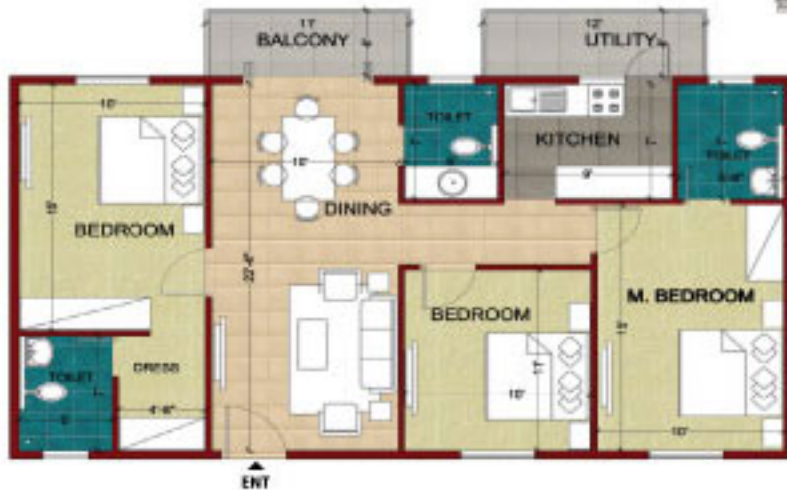
3 Bed Room Unit-Type - 2 Super Builtup Area - 1255 sqft